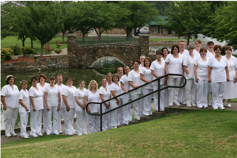
RMCC 2010 LPN Class